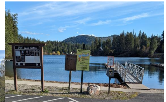
Fireside Boat Launch